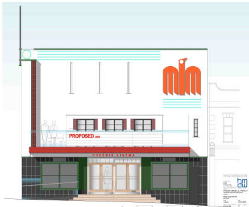
Phoenix's Proposed Facade

There is still a huge amount of work to do to turn these plans into reality. Our aim is to restore, renovate and